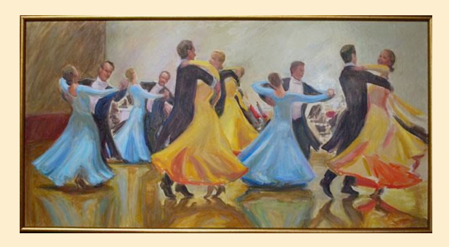
Black Tie Dinner and Dance